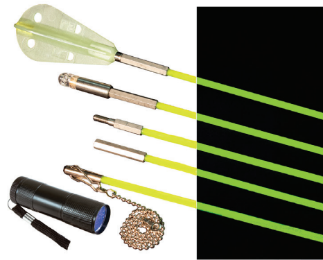
Black Light 30ft Rod Kit